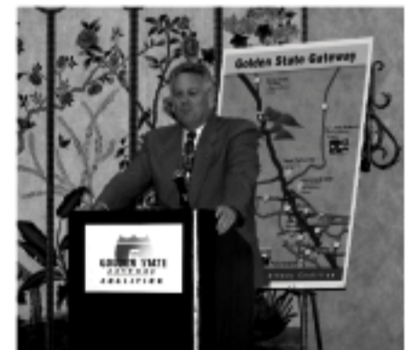
State Assemblyman Keith Richman Photography by: Fleetwood Communications

Photography by: Fleetwood Communications